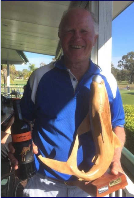
“FORE!!! Images from the annual Kirra Golf Day held on the Sunday 29 th July 2018 at the Wynnum Golf Club”