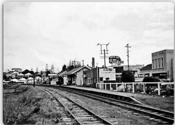
“Above Left: Kirra Beach Pavilion (Kirra SLSC clubhouse) under construction in 1935; Above right: Coolangatta Railway Station during the early 1960s”