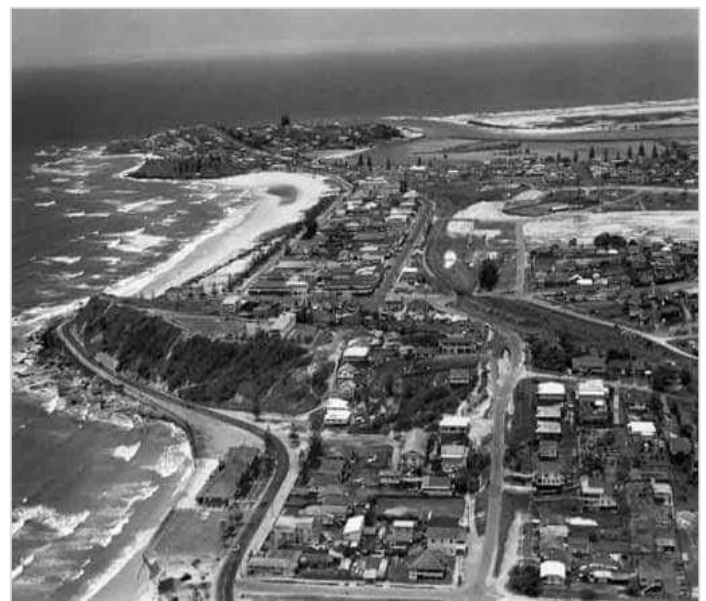
“Above: Aerial photograph of Kirra Beach and Coolangatta taken by Fred Lang in 1938. Kirra SLSC’s new clubhouse and carpark are in the foreground. The Kirra Beach Hotel did not exist in those early years”