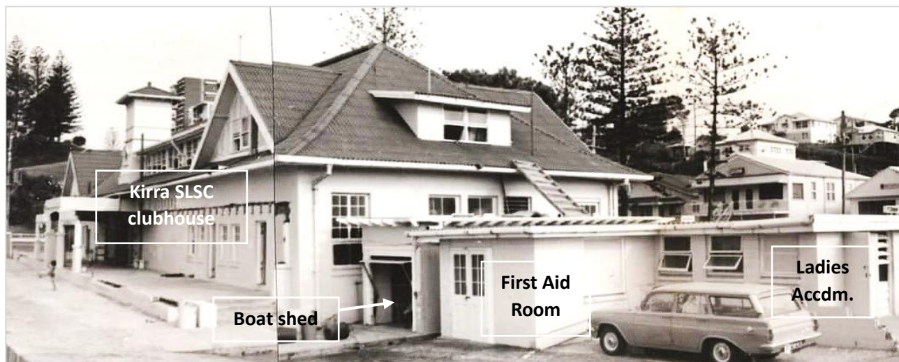
"Above: Kirra clubhouse in late year 1974. No veranda awing (for twenty years) following cyclonic damage caused in late January 1974. On the western end of the Kirra Beach Pavilion was a small Boat Shed, First Aid Room, and Ladies Accommodation for wives and girlfriends. There were no female active members permitted in surf lifesaving until year 1980. This photograph was taken several months prior to these surf club facilities being demolished for the construction of the new western annex building that provided the surf club with a large boat shed, member amenities, female dormitory, caretakers unit, and the members lounge known as the Blue Room (future Kirra Supporters Club)"