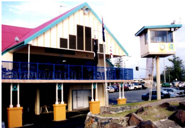
“Left: The balcony viewed from the beach access ramp.... Things to note include the flagpole (where did it go??); The Club built patrol tower (it’s gone); and the ocean walkway that was away from the immediate area in front of the boatshed.... now that was a plus!”

Came across some interesting photos dating back to a year that I believe was early 2000s??