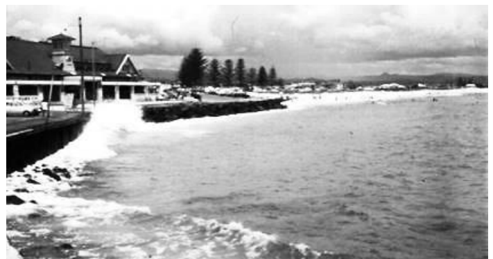
“Above Left: Kirra Beach with plenty of sand in summer 1969; Above Right: Where is that beach? – January 1970”