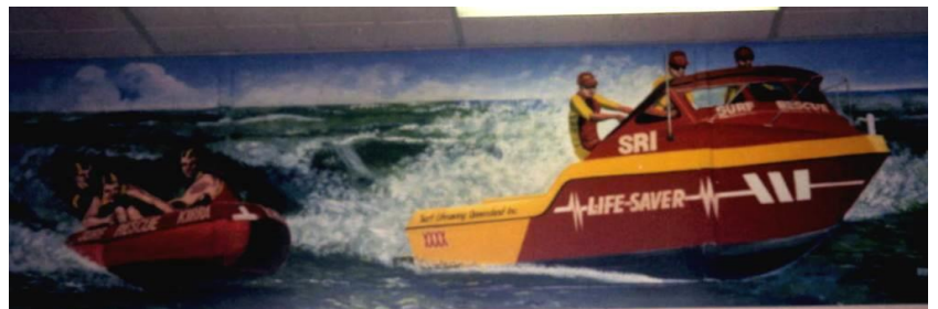
“Above right: The JRB/IRB mural that was prominent inside the licensed Supporters Club for many years.... Sadly it was required to be destroyed to accommodate the building construction in 2010/11 associated with enclosing the balcony and improving the venue and safety for patrons.... Guess who is driving the JRB and IRB?”

Remembering the 105 year journey of the Kirra SLSC (Est: 7 th January 1916) and its many members is so important.... this provides the foundations of who we are! However, whilst one must never dwell and wish a return to what once was, that cherished and recorded history should always be considered when determining the future strategic directions for the surf club: Traditions – People – Future – Performance – Achievements