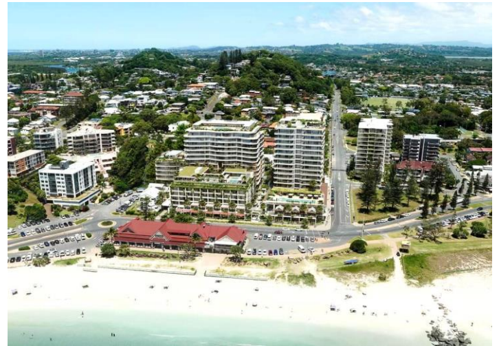
“Above: The world famous Kirra Beach – (Left) in the early 1980s and (Right) with high-rise development in progress throughout our small community (November 2023)... Tower one on Miles Street now completed for the new Kirra Beach Hotel redevelopment”