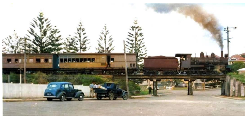
“Left: The north bound train departing the Griffith Street, Coolangatta Railway Station for Brisbane in the late 1950s. Kirra Surf Club members living in Brisbane would regularly use the train for their travels to and from the surf club.... now that would have been an adventure!”