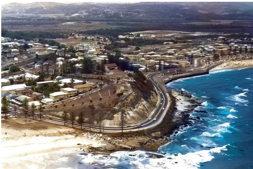
“Left: Kirra Point and (below) the communities of Kirra Beach and Coolangatta in the early 1960s”