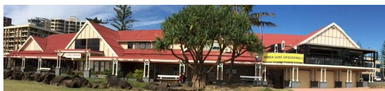
“Kirra Surf Life Saving Club established 7 th January 1916 is the second oldest surf lifesaving club in Queensland”