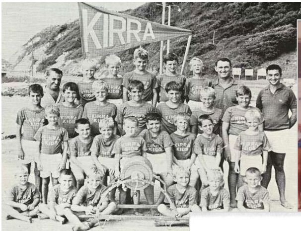
"Left/Below: The tradition continued – Kirra Nippers 1968 and 1989"