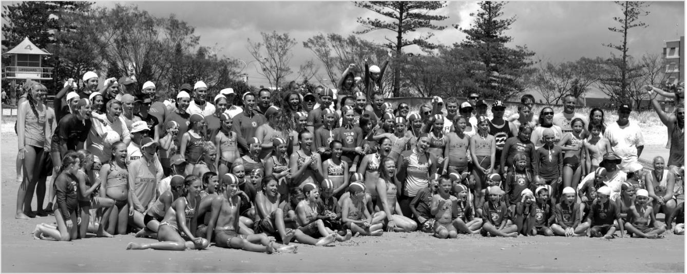
“Above: Kirra Nippers (2013)”

Kirra’s Junior Activities (Nippers) continue with the traditions established in 1920!