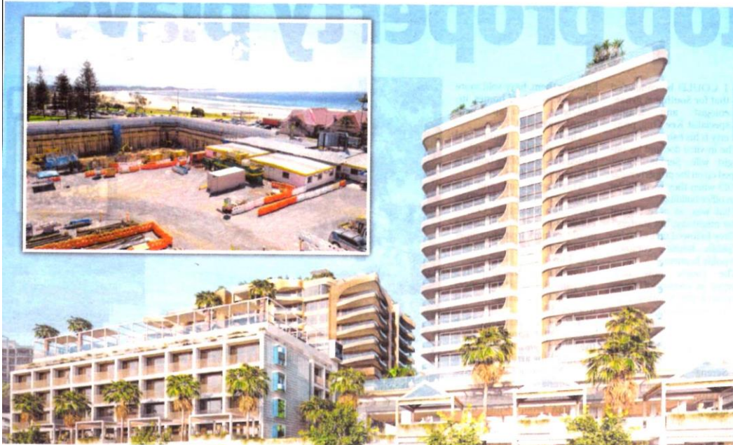
Artist impression and site shot of the Kirra Beach Hotel site and the Kirra Point project.