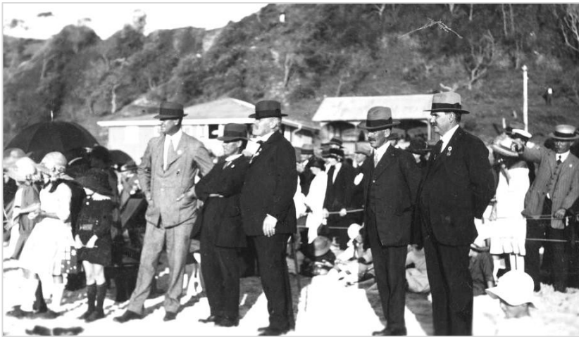
"Left: A surf carnival at Kirra Beach was a formal affair with officials and spectators dressed accordingly - Early 1930s"