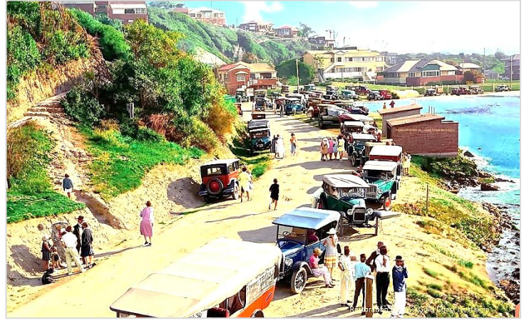
"Above: The year was 1918 and the narrow track around Kirra Point had only recently been opened for the driving public. Your Kirra Surf Life Saving Club formed on the 7 th January 1916 was only two years young... Kirra Beach became renowned for attracting plenty of locals and visitors to the beach."