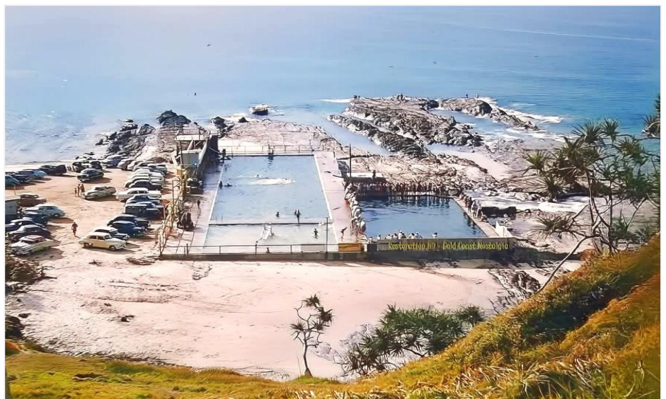
"Right: Jack Evan's Snapper Rocks Pools in the 1960s... Kirra SLSC members would often complete their annual pool proficiency swims (400 metres in eight minutes) in the main pool during the 1960s and early 1970s"