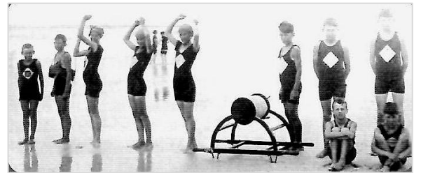
"Above: Kirra Juniors (Nippers) in the early 1920s... They were a World's FIRST! "