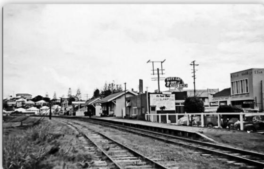
"Left: Coolangatta Railway Station in the early 1960's around that period of the closure of the train service between Brisbane and Coolangatta. Many Kirra SLSC and other surf club members of a past era often utilised the train to travel from and to Brisbane for their surf club activities"