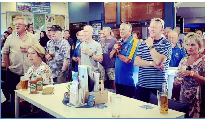
“Coordinated and sponsored by the Kirra Surf Club Old Boys Association”