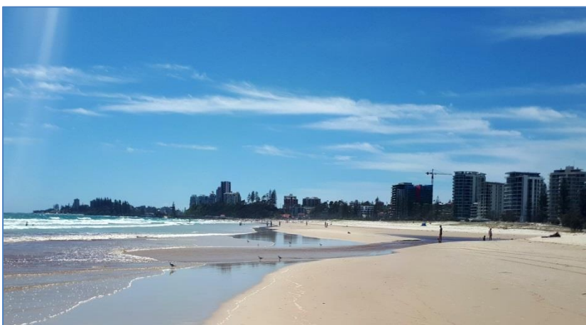
“Left: It is a beautiful morning at Kirra Beach – Monday 28 th December 2020.... Where else would you rather be?”

Volunteerism: “The principle of donating one’s personal time and energy through providing support for the benefit of other people and/or an organisation within the community as a social responsibility rather than for any individual gain, reward or financial opportunity”