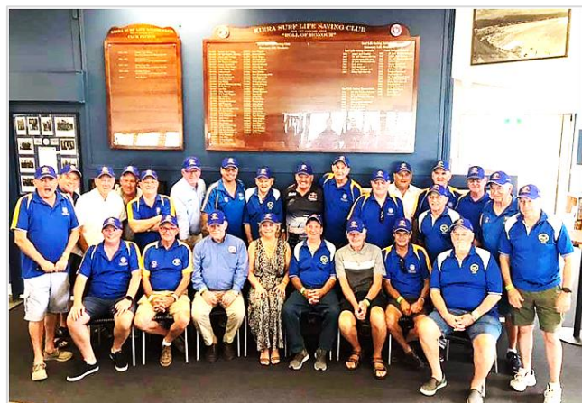
"Above Left: The mighty 'Royal Blue and Gold' is showcased at the Association's 47 th Christmas Reunion at the Pineapple Hotel; Above Right: Kirra SLSC Honorary Life Members join together in October 2019 for the official unveiling of the Kirra Life Member Honour Board"