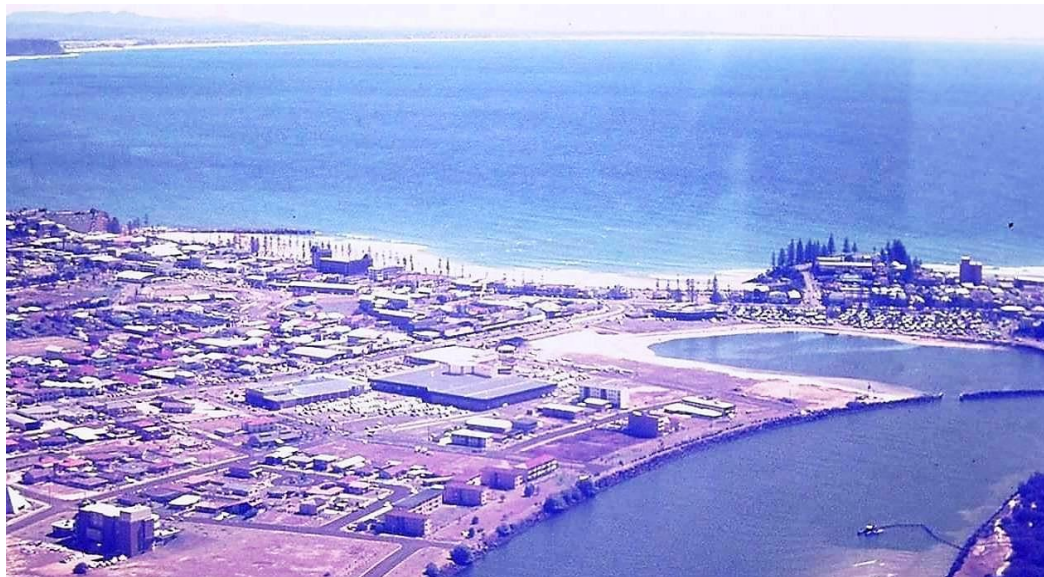
“Left: The twin towns (Coolangatta and Tweed Heads) in 1974.... No high rise buildings and there was still a surf village feel..... Kirra SLSC had obtained its first Jet Rescue Boat (JRB) of a Smith design that was delivered and operational in the second half of the 1972/1973 patrol season. It would be regularly seen on the Tweed River negotiating the ‘bar’ to undertake ocean patrols along the southern Gold Coast beaches”

Enjoy the articles and photographs in this January 2022 Newsletter. If you have any items of interest or photographs for our future Newsletters, please contact the Association’s Secretary: kirra@kirraoldboys.com and arrangements can be made to collect, copy and return these to you once copies have been made.