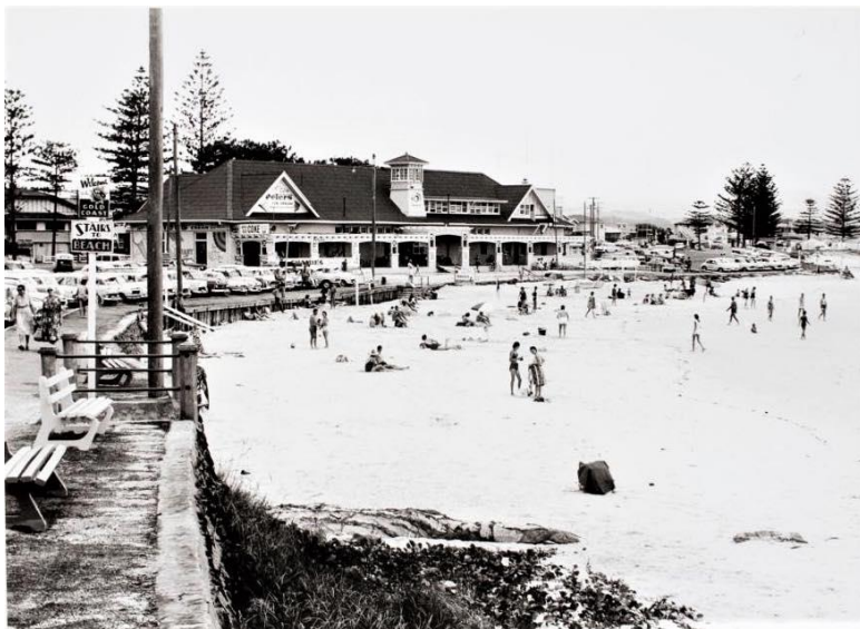
“Right: Kirra SLSC clubhouse building in 1964... The Surf Club occupied the majority area of the Pavilion. Kirra Surf Club in partnership with the Coolangatta Town Council built the Kirra Beach Pavilion in 1935 as its new clubhouse for member and surf lifesaving purposes...”