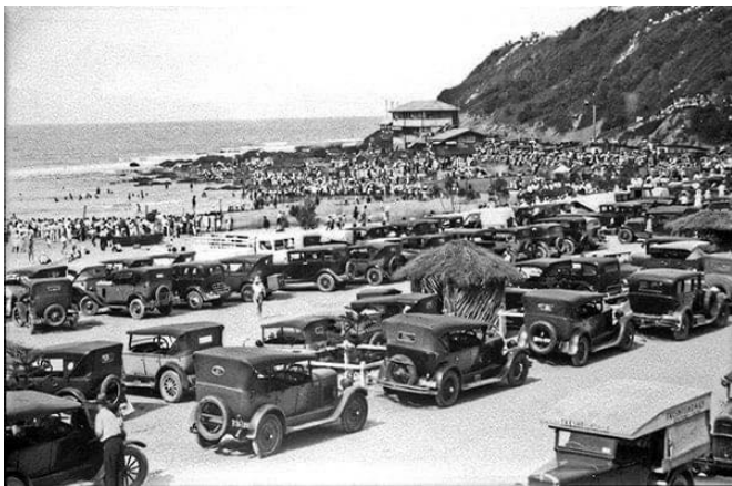
“Left: The first Point Danger Championship held in 1928 and yes it was at Kirra Beach! Can you see the large Kirra SLSC clubhouse building on Kirra Point?”