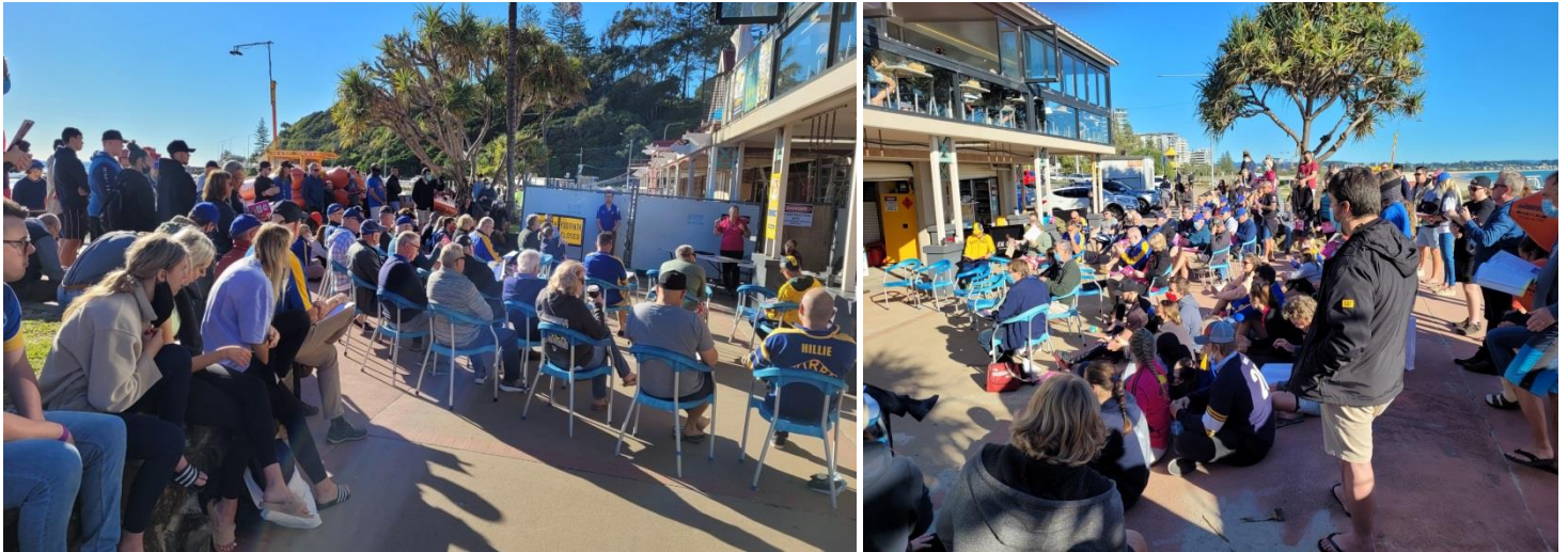
"Above: Photographs of the large attendance of members and supporters at the Kirra SLSC Annual General Meeting held Sunday, 18 th July 2021. Owing to COVID restrictions the meeting was held outside and in the sunshine at Kirra Beach"