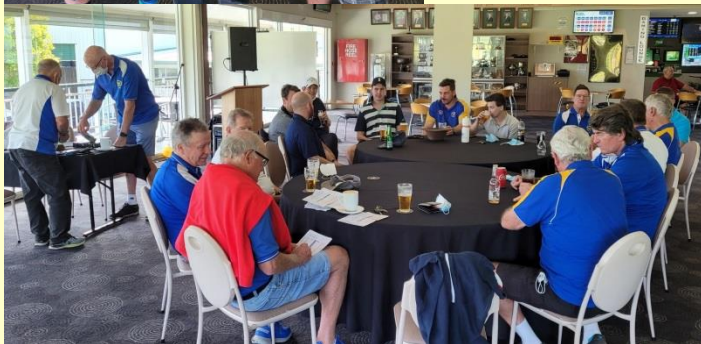
"Below - A day of fun by all attending"