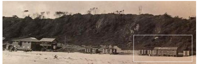
"Above: It was Year 1918 at Kirra Beach"

Do you remember? – Kirra SLSC clubhouses over the past 100 years!!