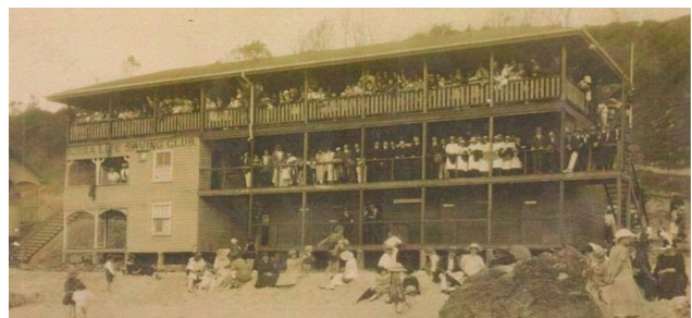
"Above: Extended Kirra SLSC clubhouse of three levels officially opened in 1925 and was valued at £850... a modern surf lifesaving building in the centre of the Coolangatta Town Council area"