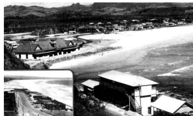
"Left: The old and the new of Year 1936 at the famous Kirra Beach in Queensland"