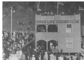
"Left: Governor Sir Matthew Nathan officially opens the new Kirra SLSC clubhouse on 30 th June 1922"