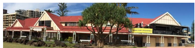
"Year 2016 – Kirra Surf Life Saving Club celebrates its 100 th Year: (Established 7 th January 1916)"