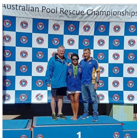
“Celebrations on Cudgen Beach for another Australian Championship event victory”