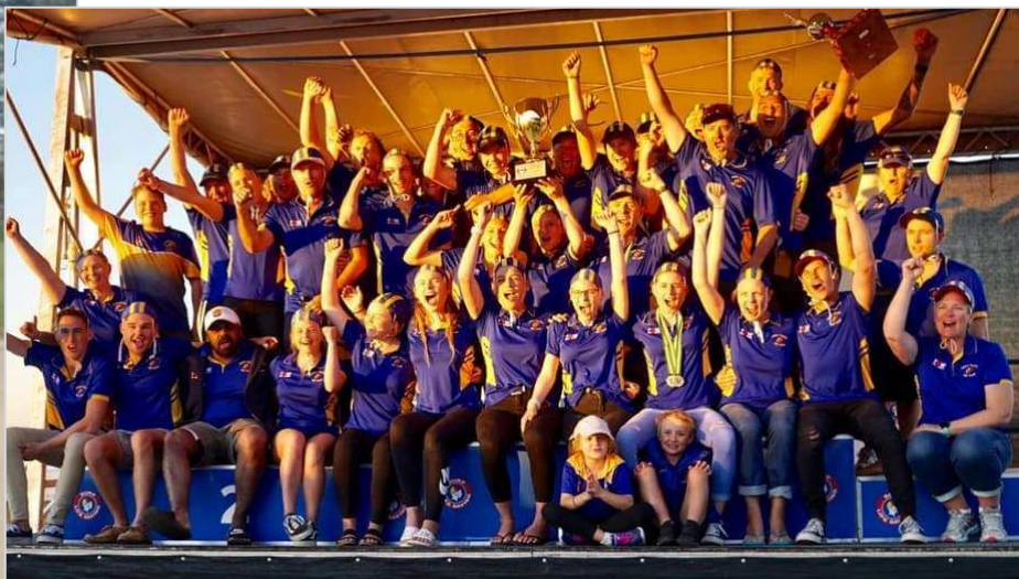
“Above: Kirra IRB Team at the 2019 Australian IRB Championship held at Cudgen NSW – Achieving Nine (9) Gold, One (1) Silver, and Two (2) Bronze Medals in championship events; and recognised as the 2019 Australian IRB Champion Club; Under 23 Years Australian IRB Champion Club; Australian IRB Champion Club (Overall Points Score)”