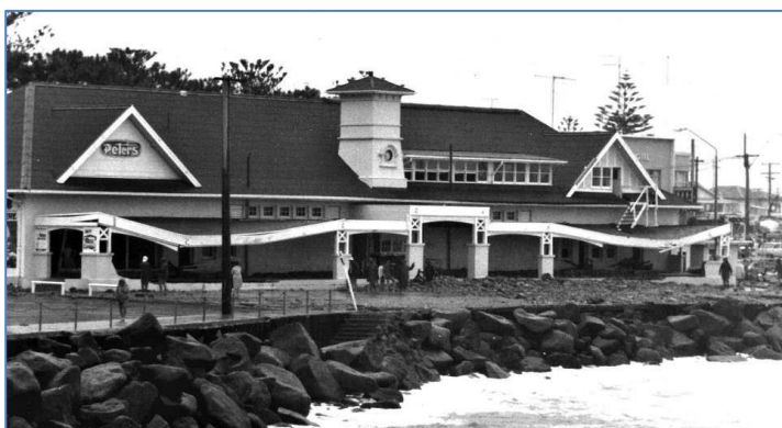
"Left: Kirra Clubhouse and cyclone damage caused in January 1974"

For further information contact the Kirra Surf Club office: (T) 07 5599 3524 or (E) kirra@kirraslsc.com