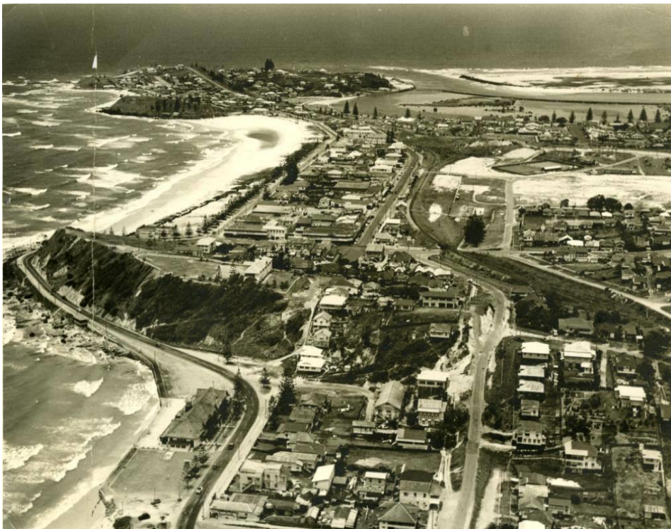
“Kirra Beach and the townships of Coolangatta and Tweed Heads in the 1950s”