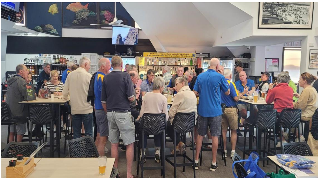
"Left: 2023 Kirra Golf Game players enjoy fellowship with mates and partners at the Kirra Supporters Club"