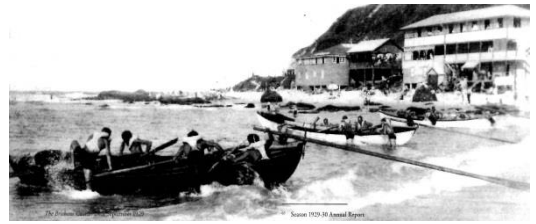
"Right: Surf boat race held at Kirra Beach in 1929 – Go Team Kirra!"