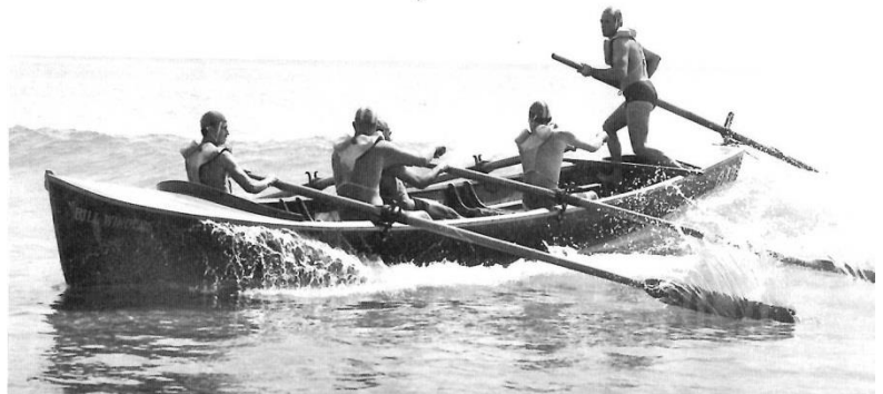
"Left: Australian Reserve Grade Surf Boat Champions – 2009 Australian SLS Championship held at the City of Perth Beach WA"