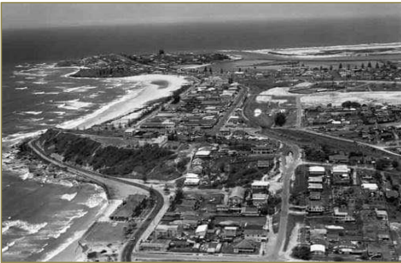
“(Right) The old and the new! Kirra SLSC clubhouses at Kirra Beach in Year 1936”

“The Kirra Pavilion has always been the clubhouse and home of the Kirra Surf Life Saving Club since it was built and officially handed to the Surf Club eighty-three years ago!”